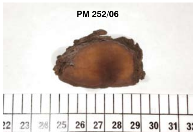
Figure 1. Macroscopic sample demonstrating cut surface of the adrenal tumour showing a pale brown cut with central haemorrhage.

A post-mortem examination confirmed the presence of a pheochromocytoma in the left adrenal: the tumour measured 6.5x6.5 cm with central haemorrhage. The pheochromocytoma stained with chromogranin and synaptophysin, with positivity of S100